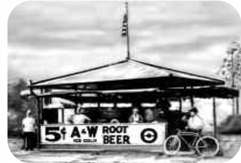
The first A&W Root Beer stand in St. Louis was built on this site in 1931.

Pepsi, Orange Crush, Lipton Green Tea, Mountain Dew or Tropicana Fruit Punch